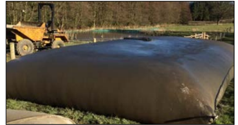
Pictured is an example of a silt container, which allows removed sediment to dry out.

Fish in the pond will not be impacted during this process. Surrounding trails will remain open to users. Cheese Ranch Historic and Natural Area is located at 9193 Sugarstone Circle.